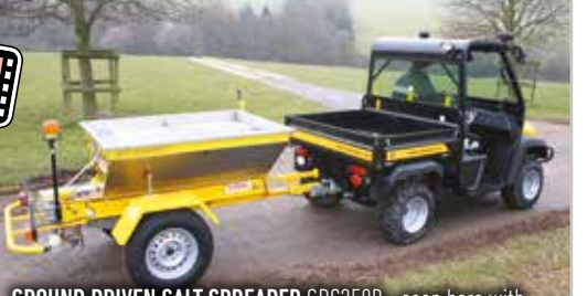
GROUND DRIVEN SALT SPREADER GDS250R - seen here with an optional Flashing Beacon GDS106.

GROUND DRIVEN SALT SPREADER GDS150R - is the smallest in the GDS range and is designed for use with any type of road salt including wet rock salt, used behind an ATV, UTV or similar vehicle. It has a stainless steel hopper and will spread from 1.5 to 12.0 metres depending on forward speed. Seen here in use with an ATV and SNOW PLOUGH S228.